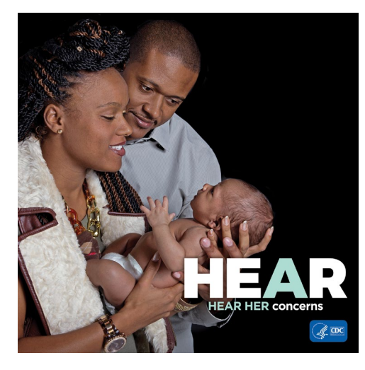
Click to download image

Message 4: If you are pregnant or gave birth within the past year, talk to a health care provider if you feel something is not right. Some urgent warning signs include a headache that won't go away and gets worse, changes in your vision, trouble breathing, or chest pain. CDC: Hear Her #HearHer #PatientSafetyAwareness #UnitedforPatientSafety