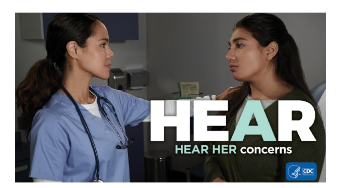
Click to download image

Message 5: Too many women die each year in the U.S. due to pregnancy-related complications. If you know someone who is pregnant or a woman who has been pregnant in past year, Hear Her concerns. It could save her life. CDC: Hear Her #HearHer #PatientSafetyAwareness #UnitedforPatientSafety