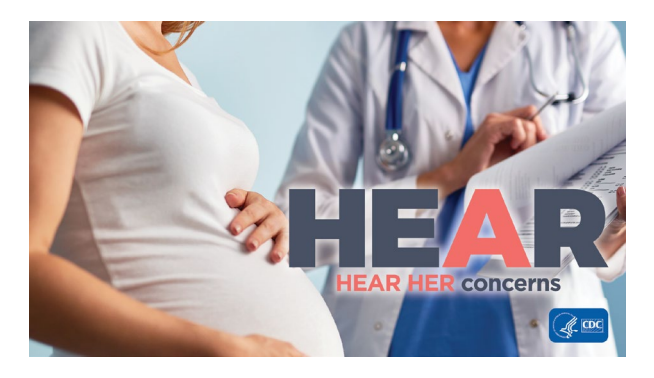
Click to download image

Message 1: About 700 women die each year in the U.S. from pregnancy-related complications. Most deaths could be prevented. Learn about how you can help save moms. CDC: Hear Her #HearHer #PatientSafetyAwareness #UnitedForPatientSafety