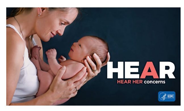
Click to download image

Message 4: If you are pregnant or gave birth within the past year, talk to a health care provider if you feel something is not right. Some urgent warning signs include a headache that won't go away and gets worse, changes in your vision, trouble breathing, or chest pain. CDC: Hear Her #HearHer #PatientSafetyAwareness #UnitedforPatientSafety