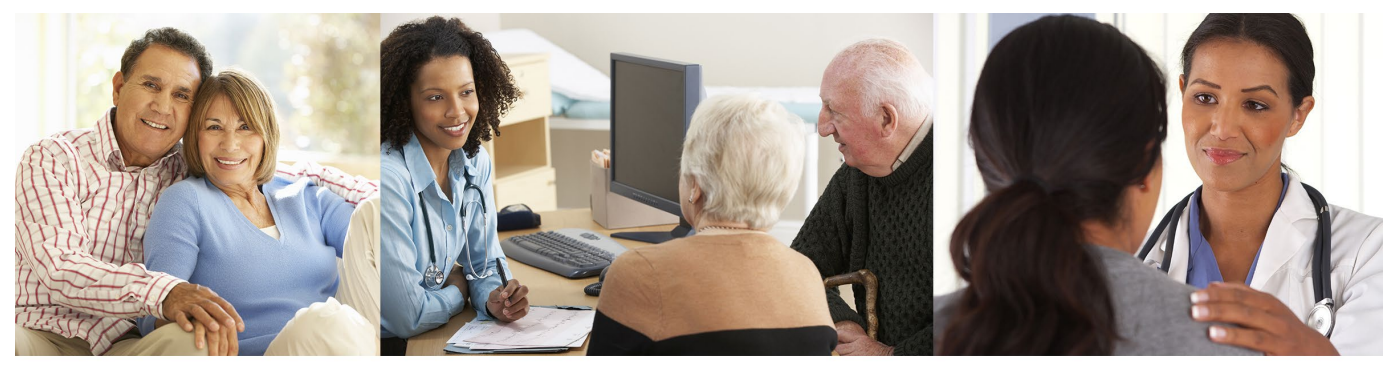
Patient Safety is Everyone's Responsibility

Your guide to raising awareness among staff, patients, and families